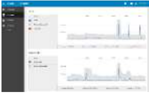
Performance Anomaly Detection

looking for anomalies that could indicate potential problems. This seamless approach ensures that real performance problems are distinguished from routine performance spikes, so that storage admins can filter out the transitory occurrences (false alarms) to avoid wasting time pursuing non-issues.