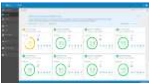
Proactive Health Score

CloudIQ takes storage analytics to a whole new level with cloud-based proactive monitoring across five critical areas of storage to deliver aggregated health scores for an unlimited number of Dell EMC midrange storage arrays. CloudIQ will non-disruptively investigate your storage performance, capacity, data protection, and configuration to correlate a health score with drill down capabilities to see more information about systems with health issues along with context-aware recommended remediation. CloudIQ aggregates Dell EMC midrange storage metrics in a secure and professionally managed EMC Cloud optimizing the operational value of your investment and lowering TCO.